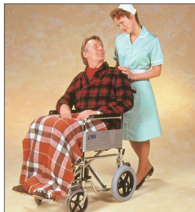
Figure 1. An increasing number of patients are spending more time in a wheelchair than ever before.

The aetiology of pressure sores is complex, although pressure, shear and friction are widely recognized as major contributing factors (Flanagan, 1993). Although many patients are given a suitable support surface to meet their individual needs while they are being cared for in bed, little consideration is given to their needs while they are up sitting. The reason for this is unclear, but it is an