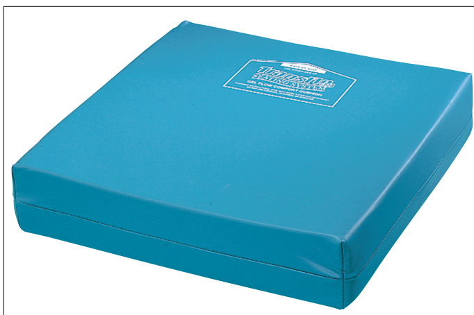
Figure 4. The Transflo cushion consists of an outer, multistretch, vapour permeable cover which covers two gel sacs surrounded by a high density foam.