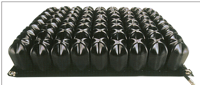
Figure 2. The Flotair cushion was designed for high to very high risk patients who are confined to wheelchairs for long periods. The cushion comes in 5 cm or 10 cm shaped cones made of neoprene rubber.

The Transair alternating cushion (Figure 5) was designed to improve patient comfort levels as well as eliminate feelings of instability and insecurity while patients are up sitting. This was achieved through its unique foam/air technology design, which combines the known benefits of both foam and alternating air cells. The foam is located within the air cells, allowing the air to circulate around the foam.