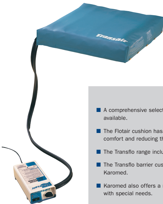
Figure 5. The Transair alternating cushion's unique foam/air technology design combines the known benefits of both foam and alternating air cells.

The Transfoam cushion is similarly constructed and is a natural adjunct to the range.